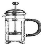
“THE CAFETIERE” Champion Coffee Making Equipment No. 3

Creme Brulee , biscotti, red fruit compote, cherry ice cream £5.95 (V) Chocolate Brownie Chocolate sauce, chocolate ice cream £5.95 (V) Sticky Toffee Pudding toffee sauce, Chantilly cream, vanilla ice cream £6.45 (V) Cheese Board Brinkworth Blue, Wiltshire Loaf, Cornish Brie £7.45 Rays Ice Cream and Sorbet – please ask for today’s options - £1.95 per scoop