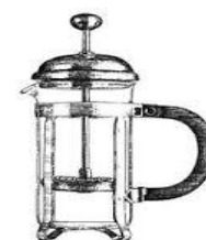
"THE CAFETIERE" Clampson Coffee Making Equipment No. 3